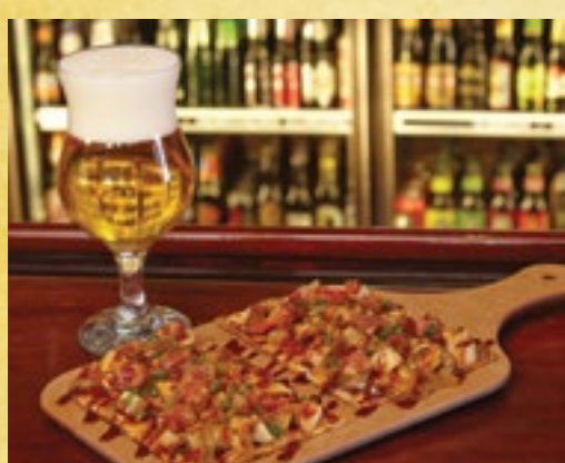
BBQ CHICKEN FLATBREAD