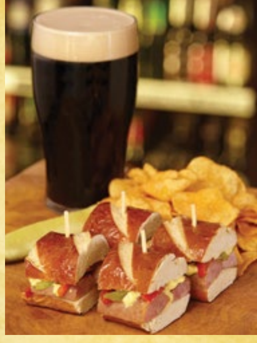
GUINNESS "BRAT" SLIDER